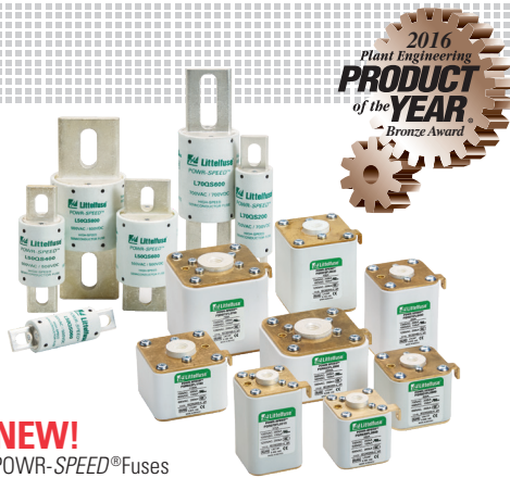
NEW! POWR-SPEED® Fuses