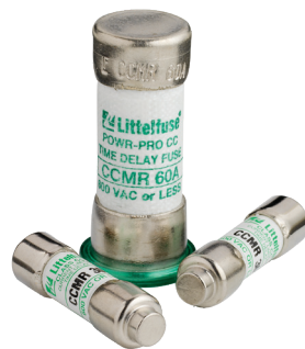
Class CC Fuses