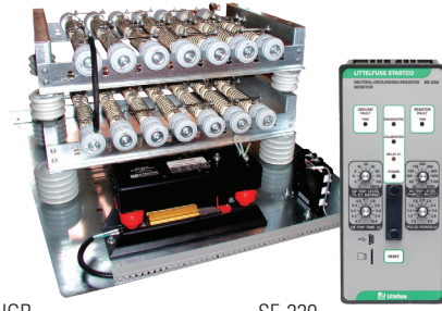
NGR Neutral-Grounding- Resistor System