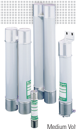
Medium Voltage Fuses