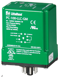
PC-XXX-LLC-CZ / PC-XXX-LLC-GM Liquid Level Controller