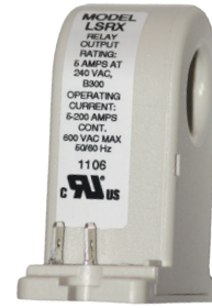
LSRX Load Sensor