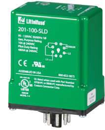
201-100-SLD Seal-leak Detection Relay