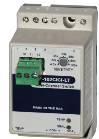
PC-102 Dual-Channel Switch Seal-Leak Detection Relay