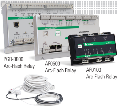
PGR-8800 Arc-Flash Relay AF0500 Arc-Flash Relay AF0100 Arc-Flash Relay