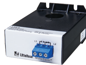
LSR-0 Load Sensor