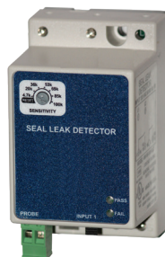
460-15-100-SLD Seal-Leak Detection Relay