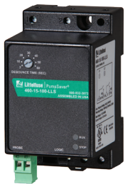
460-15-100-LLS Liquid Level Detection Relay