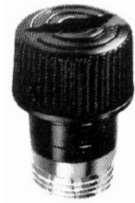
585 Cap SLOTTED TOP FOR 5x20MM FUSE