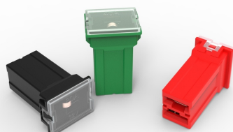
PAL Fuses - 2938 Series