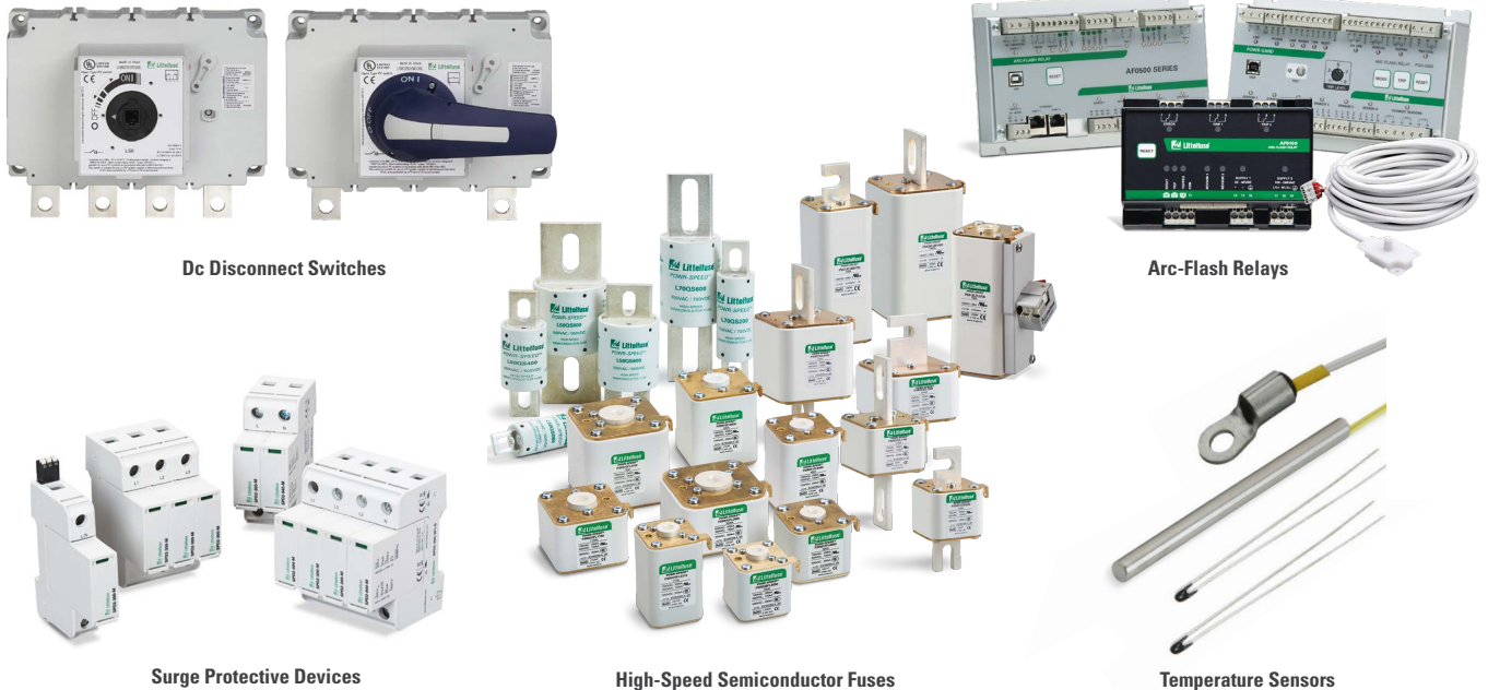
Dc Disconnect Switches