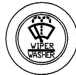
FRONT VIEW OF KNOB