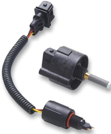
Figure 1: Water in Fuel Sensor