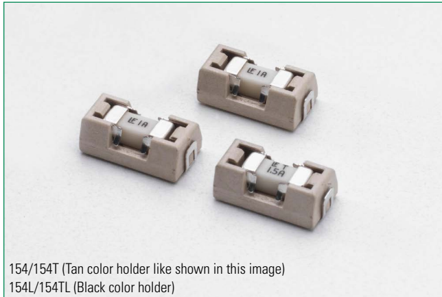
154/154T (Tan color holder like shown in this image) 154L/154TL (Black color holder)